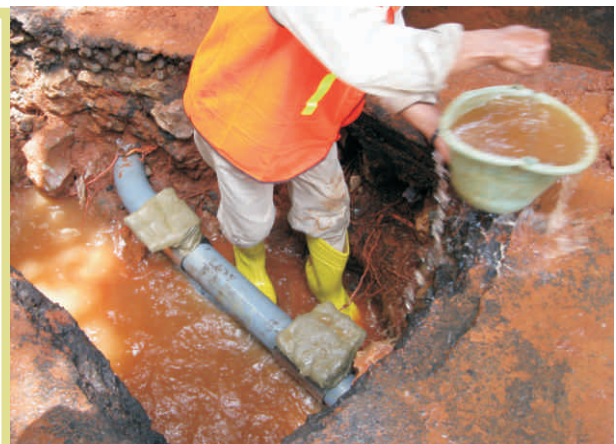
A worker is repairing a leaky water pipe in central Jakarta