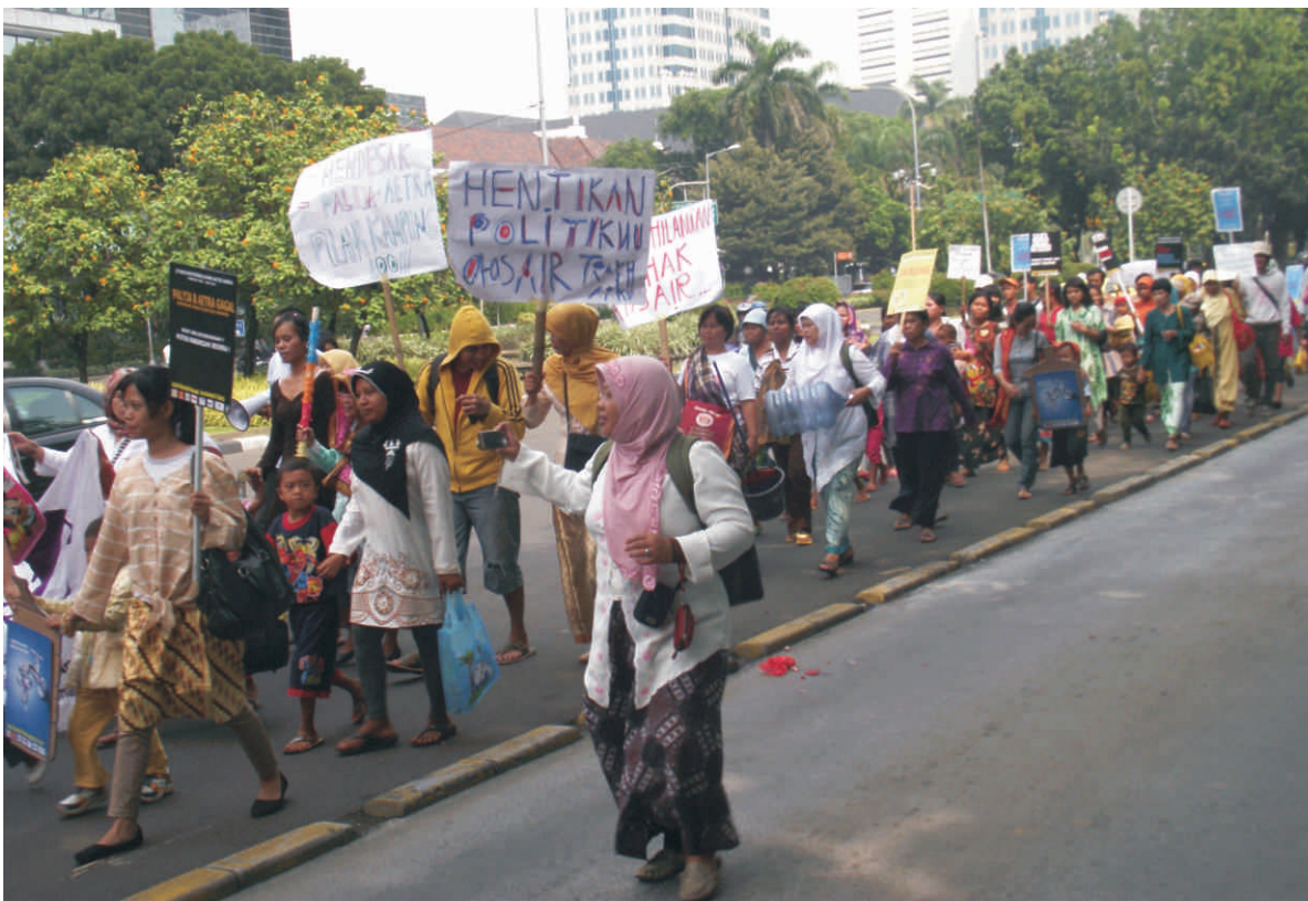
Protesters marched in June 2011 to urge the government to end Jakarta water privatization.

privatization, the water tariff has increased ten times making Jakarta's the highest water tariff in South-East Asia. The poor can barely afford these water services. 4