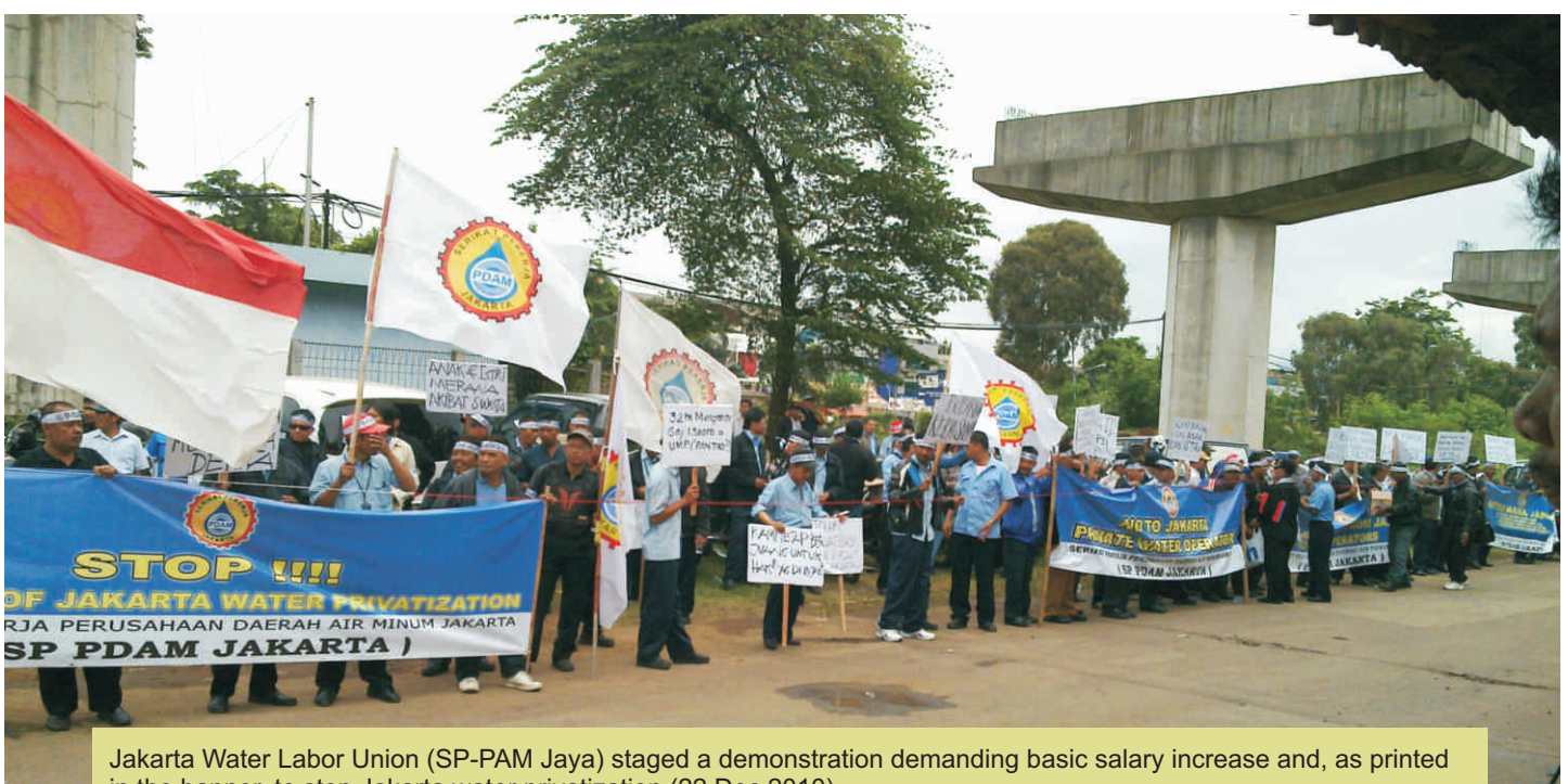
Jakarta Water Labor Union (SP-PAM Jaya) staged a demonstration demanding basic salary increase and, as printed in the banner, to stop Jakarta water privatization (22 Dec 2010)

a basic salary increase which they have not had since 2003. 12